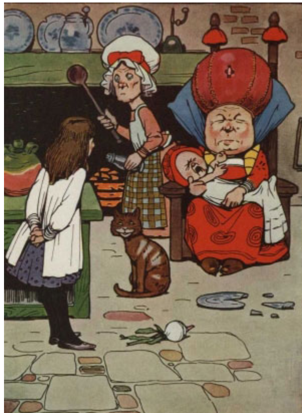
Alice in the Room of the Duchess.

Copyright, 1916, by SAM'L GABRIEL SONS & COMPANY NEW YORK